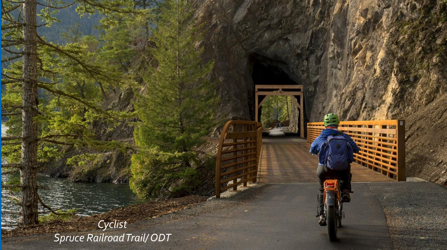
Cyclist Spruce Railroad Trail/ODT

Another feature of the trail is the Adventure Route . The ODT and Adventure Route are being built by the volunteers of the Peninsula Trails Coalition.