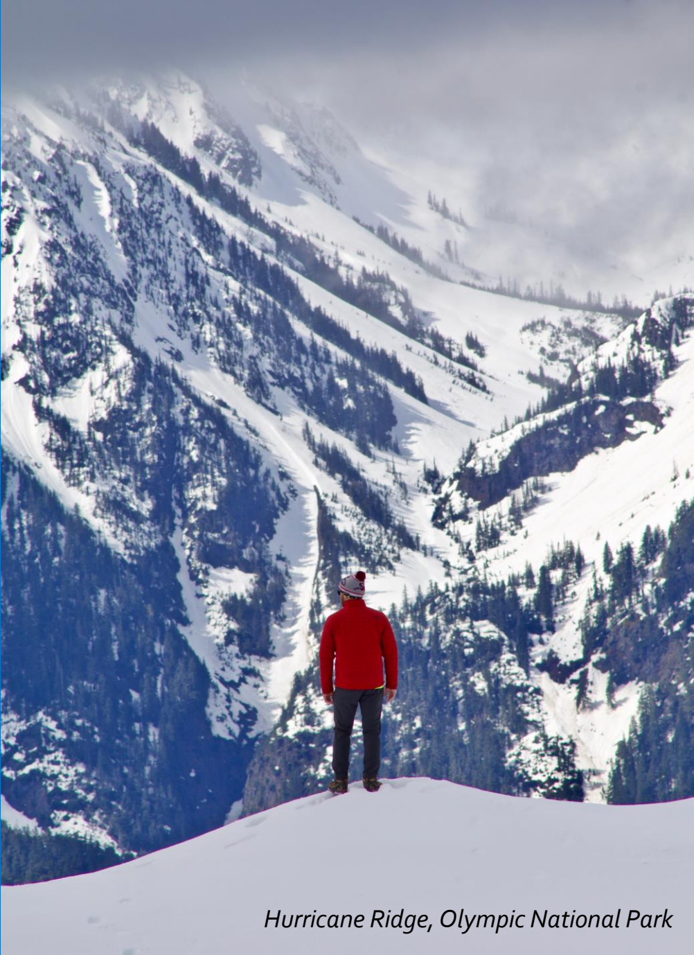
Hurricane Ridge, Olympic National Park