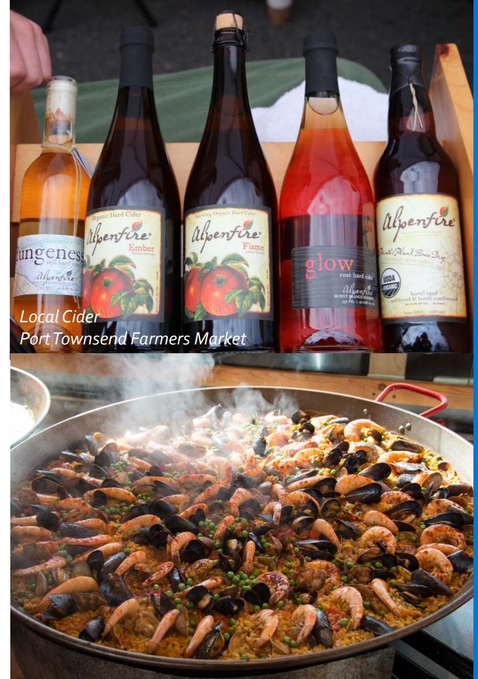
Local Cider Port Townsend Farmers Market