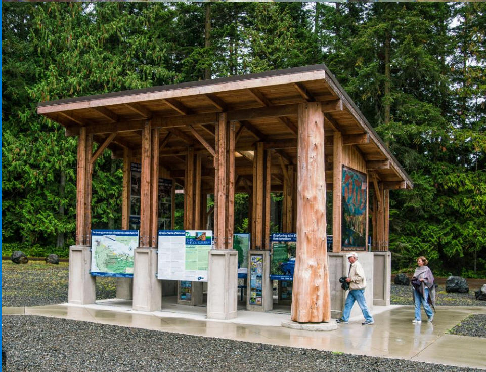
Elwha Dam Interpretive Kiosk