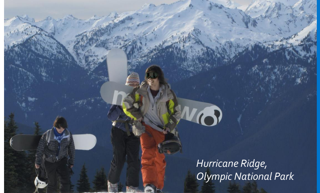
Hurricane Ridge, Olympic National Park

Travelers to the peninsula can choose from kayaking, rafting, canoeing, scuba diving, or stand-up paddle boarding in the lakes, rivers and ocean. The peninsula is also home to some of the Pacific Northwest's most-fertile fishing grounds. Fly fishing in the Sol Duc River's perfect, pristine environment grants a special year-round pleasure for fishermen of all levels. On land, visitors can explore the fresh and saltwater shorelines, try a guided hike through the Hoh and Quinault rain forests, bike along the Olympic Discovery Trail , snowshoe atop Hurricane Ridge, hunt for waterfalls, look for whales, or relax in Sol Duc Hot Springs .