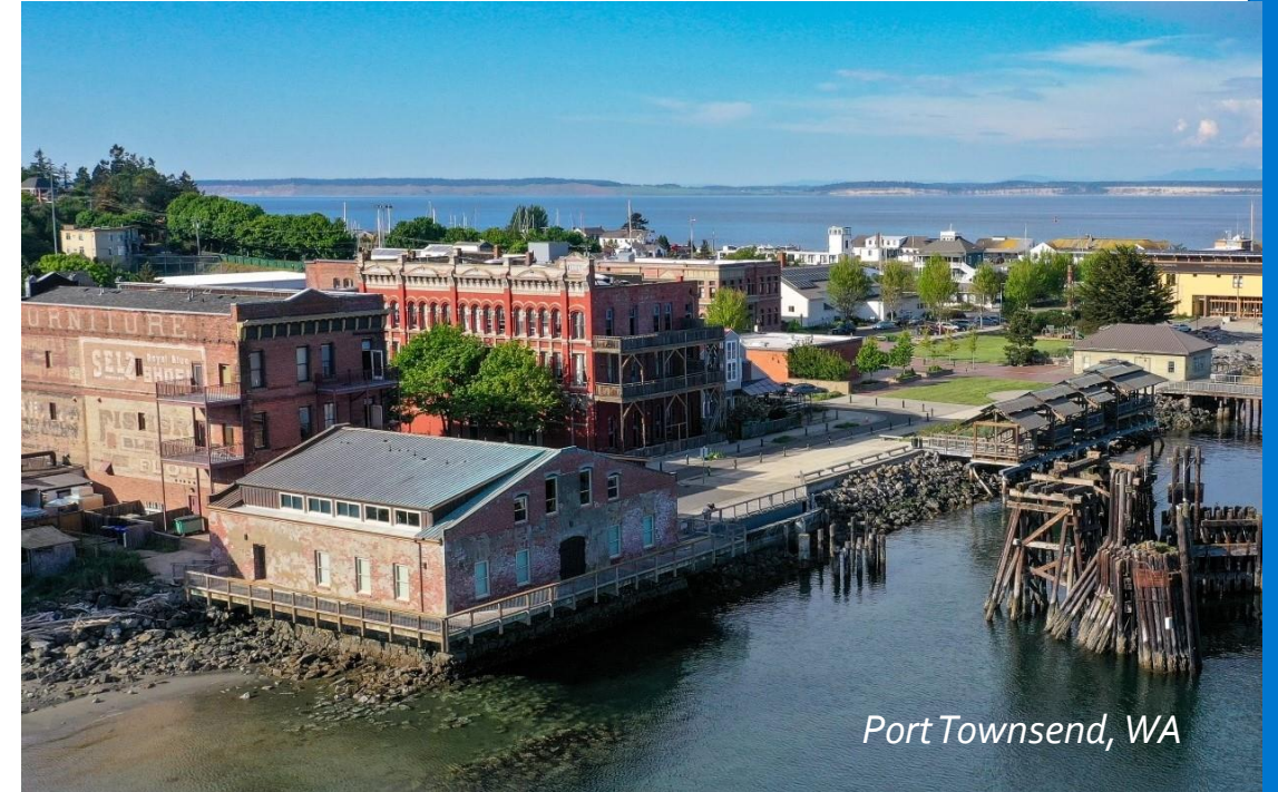
Port Townsend, WA

The forestry heritage of this town is evident in its turn-of-the-century architecture. A variety of attractions, including skydiving, railroad riding and motocross feed those craving adventure. Population: 10,700