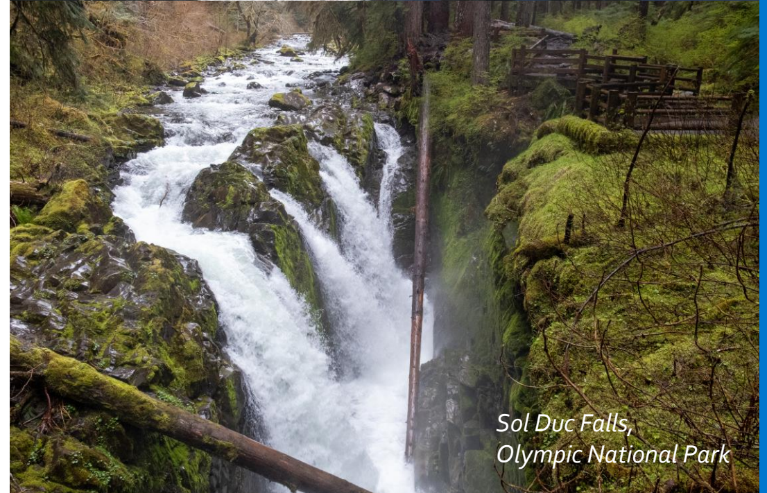
Sol Duc Falls, Olympic National Park