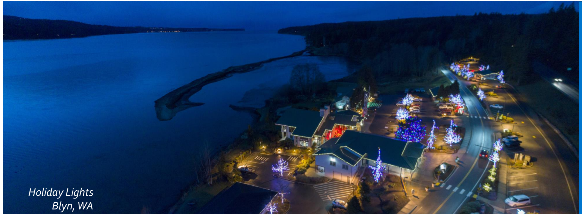
Holiday Lights Blyn, WA