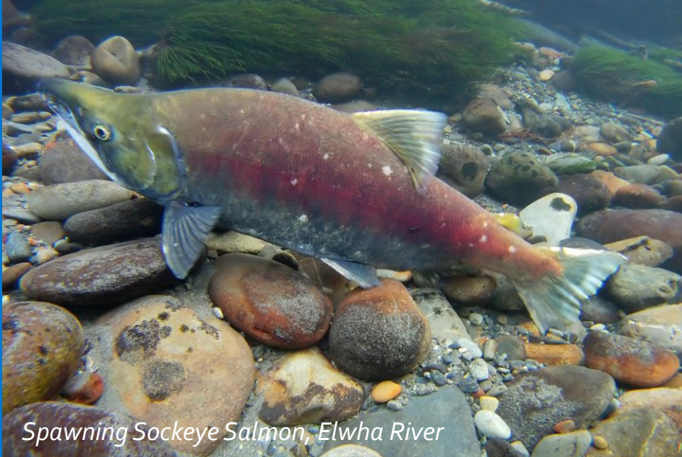
Spawning Sockeye Salmon, Elwha River

The Elwha Dam Interpretive Kiosk on Highway 112 near the site of the former Lake Aldwell tells the story of building the dams, deconstruction and final valley restoration.